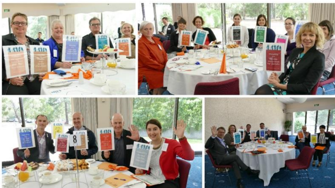
L: Leaders' Breakfast participants contribute to the #HandsUp for Gender Equality campaign