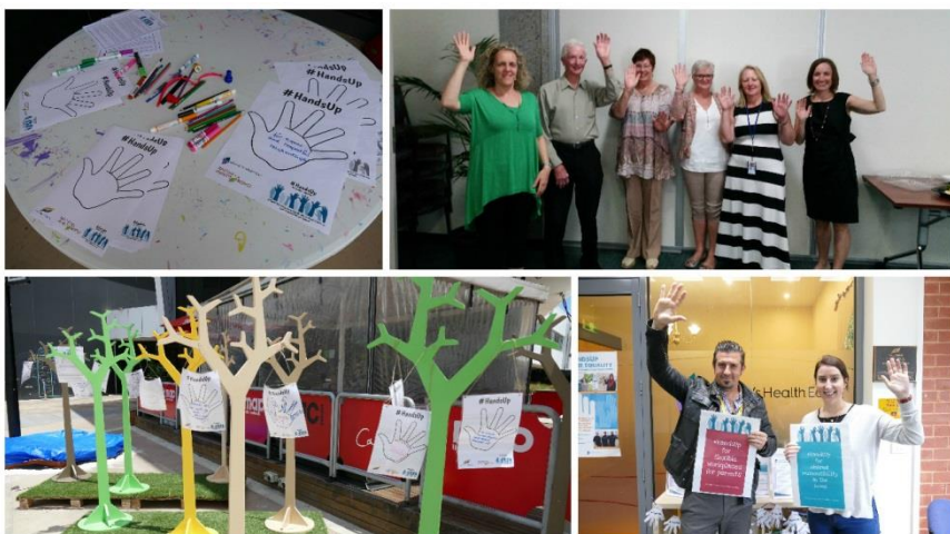
Above: #HandsUp contributions from Maroondah CC, Manningham CC and Inspiro

Although the 16 Days campaign has formally concluded, you might still like to use the resources for other events. So head to the WHE website to check out the campaign resources and more information, or give us a call.